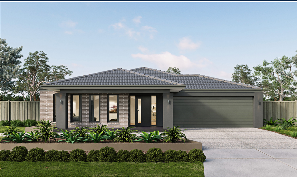
Price excludes upgrade items above standard specification such as feature render and bricks, front entrance timber decking, front entry door, brick infills above garage, external lighting, fencing, concrete paths and driveway. Façade Image may also contain items not supplied by Metricon Homes, namely landscaping and planter boxes.