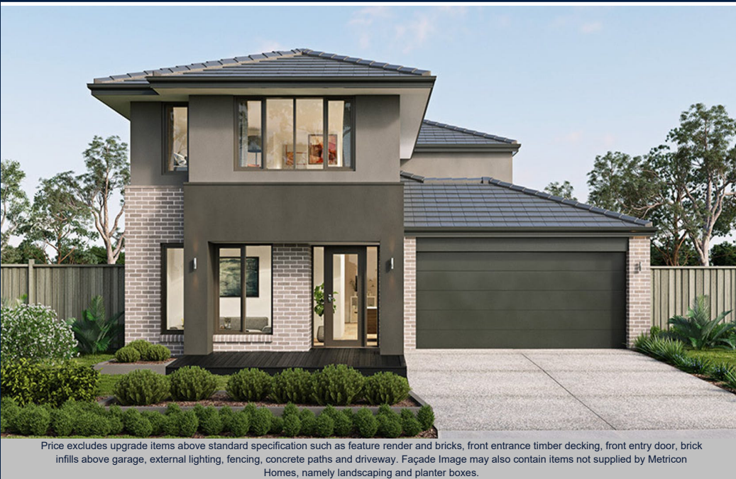
Price excludes upgrade items above standard specification such as feature render and bricks, front entrance timber decking, front entry door, brick infills above garage, external lighting, fencing, concrete paths and driveway. Façade Image may also contain items not supplied by Metricon Homes, namely landscaping and planter boxes.